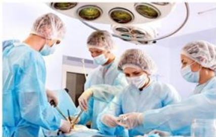
(A) (B) (C) (D)