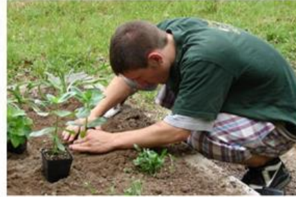
(A) (B) (C) (D)