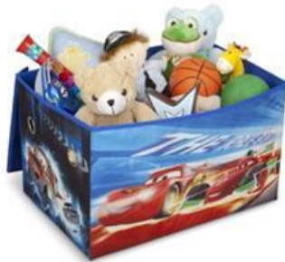
(A) (B) (C) (D)