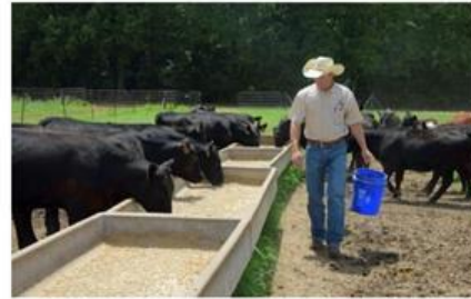
(A) (B) (C) (D)