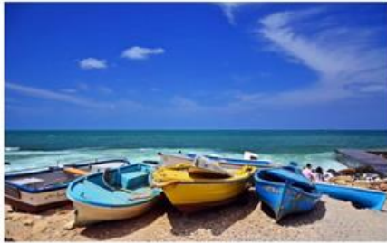
(A) (B) (C) (D)