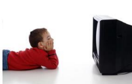
(A) (B) (C) (D)