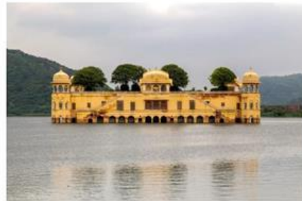
(A) (B) (C) (D)