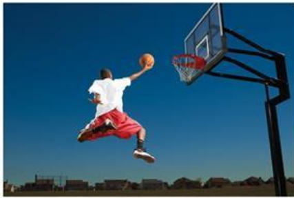
(A) (B) (C) (D)