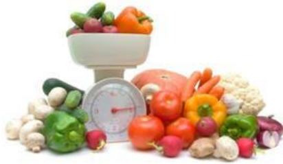
(A) (B) (C) (D)